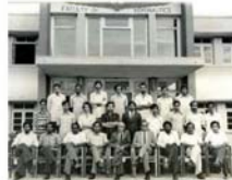
The 29th batch of MIT's aeronautical engineering students which passed out in 1970.

It is a special moment for MIT as it has produced another top class scientist after Abdul Kalam, who had scaled to the highest position in Indian Space Research Organisation after nearly four decades of hard work. He shares a special bond