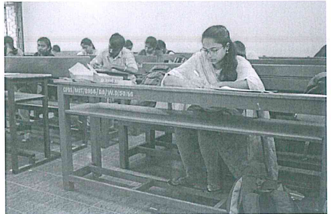
Creative writing round in Persofest '19