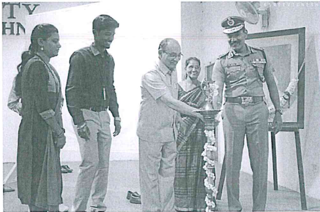
Inauguration of Persofest 19