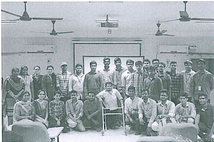
PDA team 2018-19